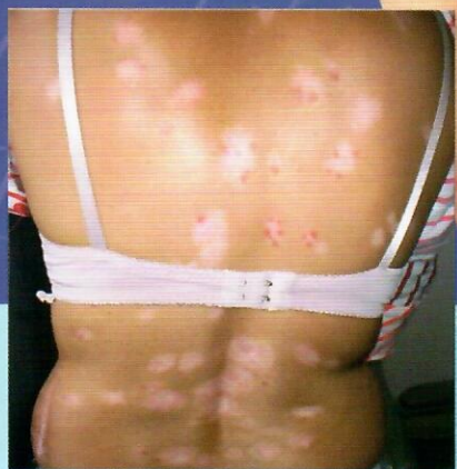
After 2 weeks of treatment