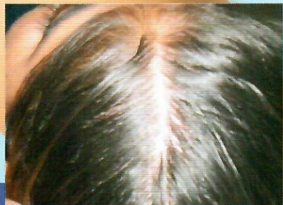
After 2 weeks of treatment