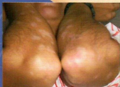
After 2 weeks of treatment