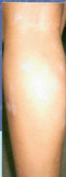
After 2 weeks of treatment